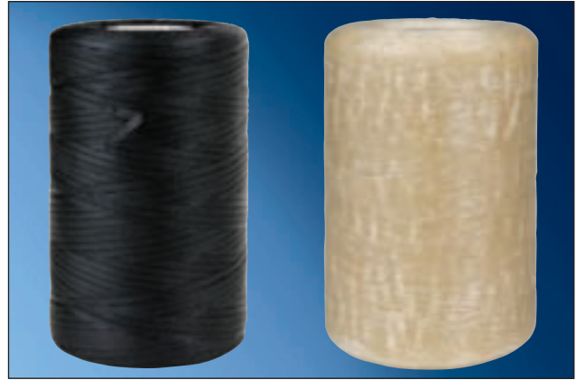
Waxed Nylon Lacing