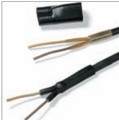
Adhesive tape HMT200A for sealing against humidity.