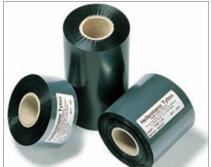
Ribbons - TTRA, TTRC+.