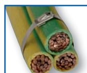
Stainless Steel Cable Tie Tensioned/Cut/No sharp edges