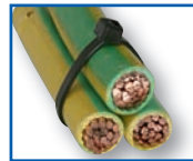
Nylon Cable Tie Tensioned/Cut/No sharp edges