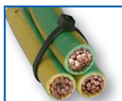
Nylon Cable Tie Tensioned/Cut/No sharp edges