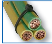
Nylon Cable Tie Tensioned/Cut/No sharp edges