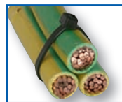
Nylon Cable Tie Tensioned/Cut/No sharp edges