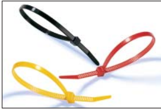
Figure 1. Plastic Ties

Cable ties are manufactured from either plastic (Figure 1) or metal (Figure 2) materials and incorporate a strap and locking mechanism (Figure 3) in one device.