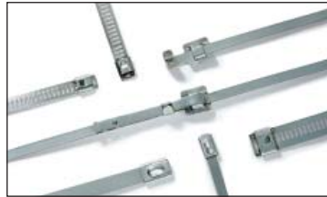
Figure 2. Metal Ties